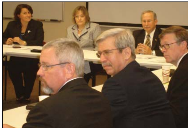
Interagency Leadership Council members and other guests gather for a demonstration of the Wake County Criminal Justice Data Integration pilot project.

Initially, CJLEADS will provide integrated court, warrant, incarceration and probation information. During the next few months, OSC and its partners will conduct a series of